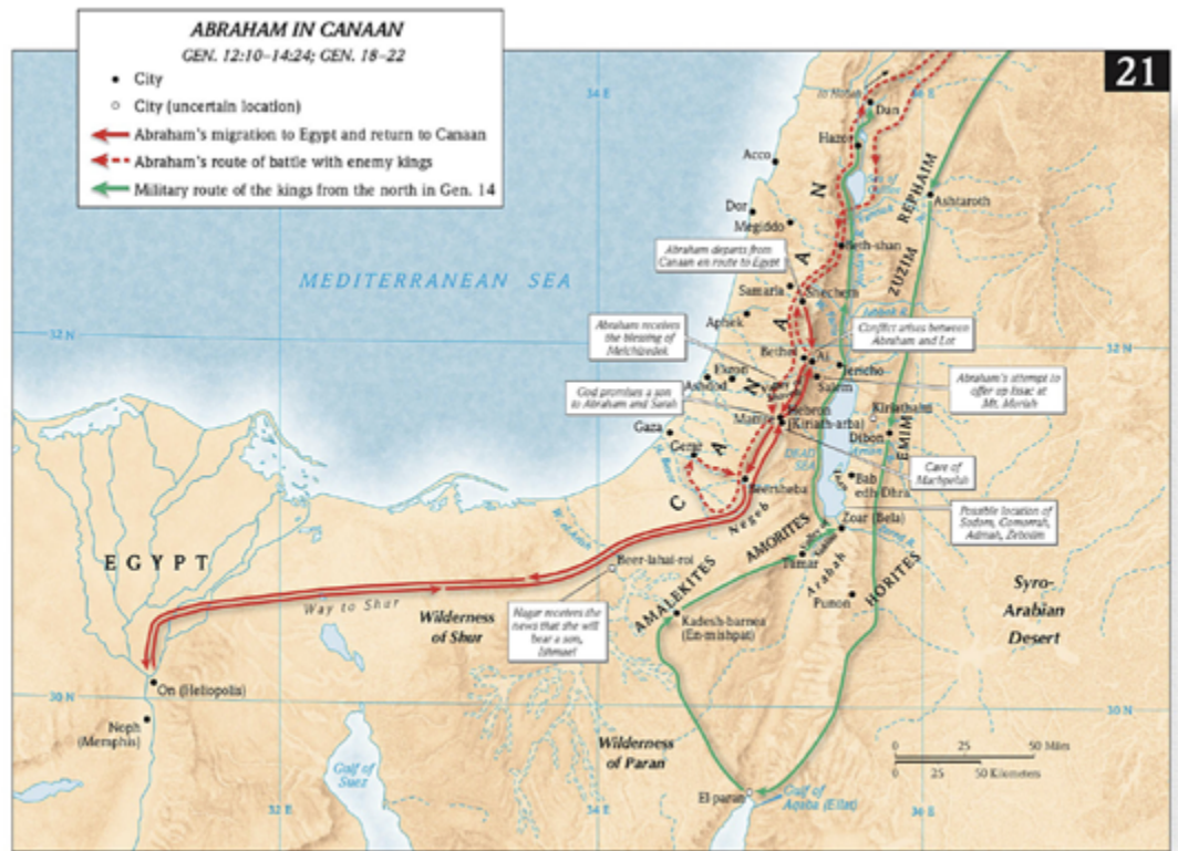
TAKEN FROM HOLMAN BIBLE ATLAS

Here's the summary: Kedorlaomer is a strong king with 3 vassal states allied with him. He came from East of Canaan and conquered Abram's Canaanite neighbours. These 5 nations eventually joined forces to rebel against Kedorlaomer. He responded with a military campaign to win back the lost territory. A big battle formed up in the Dead Sea valley, but the Canaanite kings lost and fled. Kedorlaomer and his allies stole goods, food and prisoners including Abram's nephew, Lot. When Abram heard the news, he took his allies, pursued Kedorlaomer's armies and recovered the kidnapped people and stolen possessions.